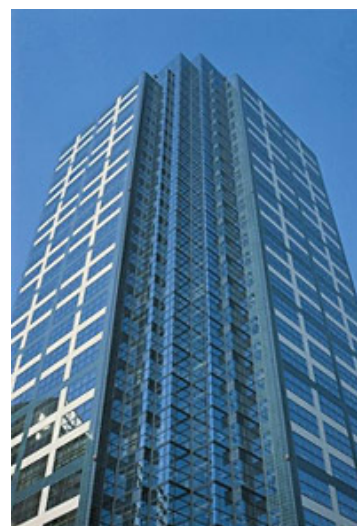
Штаб-квартира GL Sciences в Японии