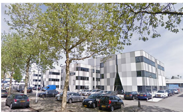
R&D центр GL Science в Нидерландах