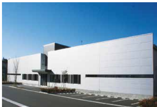
Завод GL Sciences в Японии