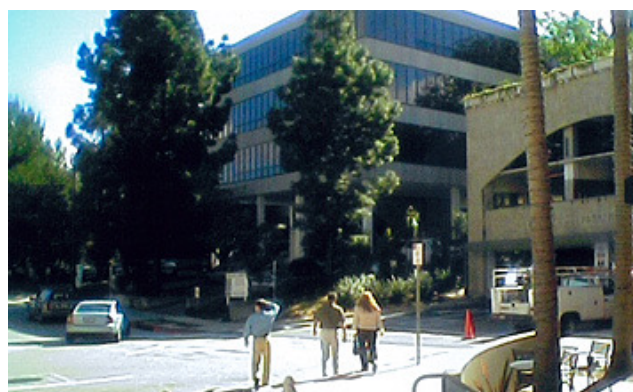
Офис GL Sciences в США