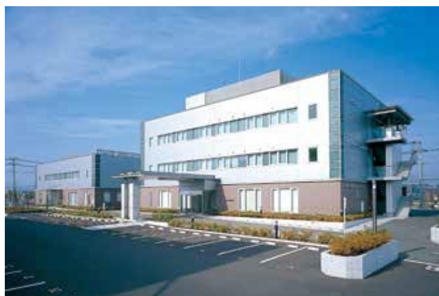
R&D центр GL Sciences в Японии